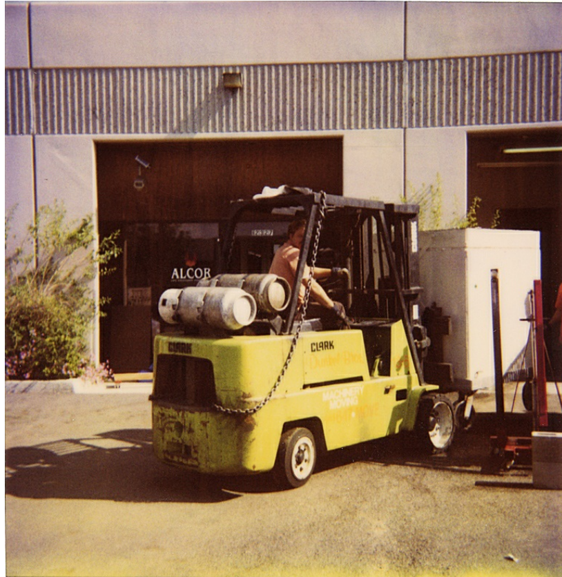
Leaving Alcor's facility in Riverside, Feb. 21, 1994. Fork lift is moving a concrete "neuro vault" holding patients in dewar inside.

California, to our new home. To mark the occasion a small celebration was held in Alcor's conference room, where we congratulated ourselves on having endured as long as we have (a primary prerequisite of a successful cryonics operation!), and made the progress we have made. There have been major advances in cryopreservation protocols, membership, and public outreach, though no one will doubt that we still have a long way to go. For those of you, the membership and supporters, who have endured and stood by us for some or all of this long time interval, a sincere thanks. We hope you will stand by us and, if your time of need should come, be cryopreserved and rewarded some day with revival!